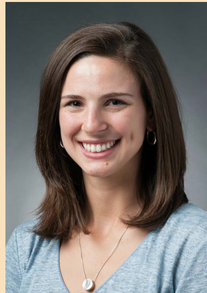
Assistant Director of Health Promotion

ACHA MEMBER: 4 years BOARD MEMBER: First year