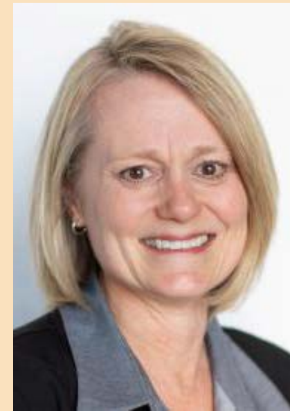
Director, Student Health and Counseling

ACHA MEMBER: 13 years BOARD MEMBER: First year