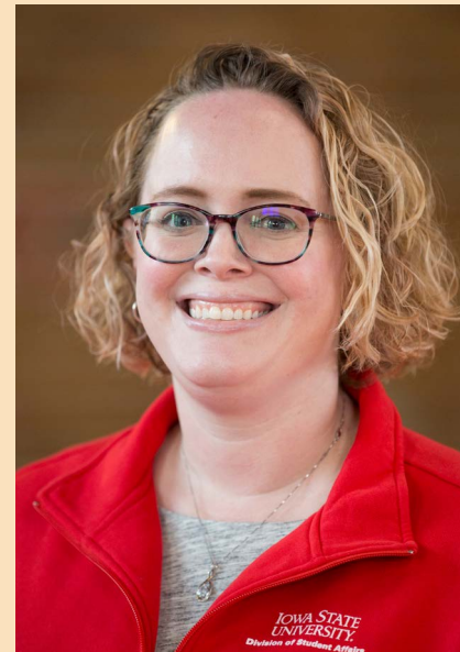
Associate Director, Thielen Student Health Center

ACHA MEMBER: 1 year BOARD MEMBER: First year