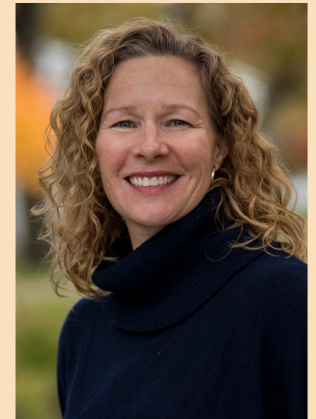
Health and Wellness Center Director

ACHA MEMBER: 6 years BOARD MEMBER: 3 or 4? years