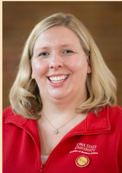
Assistant Vice President for Student Health & Wellness and Director, Thielen Student Health Center

ACHA MEMBER: 4.5 years BOARD MEMBER: 2 years