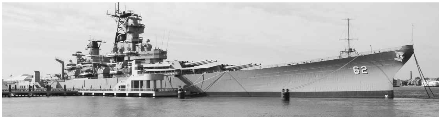
The U.S.S. New Jersey, the most decorated battleship in U.S. Naval history, is a floating museum and memorial on the Camden Waterfront in Philadelphia.

ACHA guards against discrimination in selecting faculty or participants for continuing education activities, and makes every effort to maintain awareness of individual differences with respect to the following, listed in alphabetical order: age; gender identity, including transgender; marital status; physical size; psychological/physical/learning disability; race/ethnicity; religious, spiritual, or cultural identity; sex; sexual orientation; socioeconomic status; veteran status. Faculty are chosen for their expertise to meet specific needs of trainees and their availability. Faculty and participants are not asked to identify any sensitive information and no selection is made on the basis of the individual differences listed above.