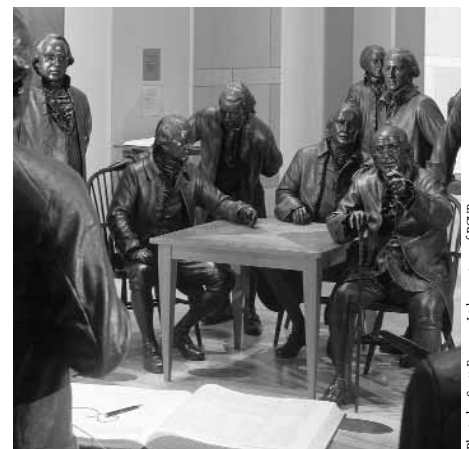
At Signers' Hall in the National Constitution Center, visitors can walk among life-size replicas of our nation's forefathers.