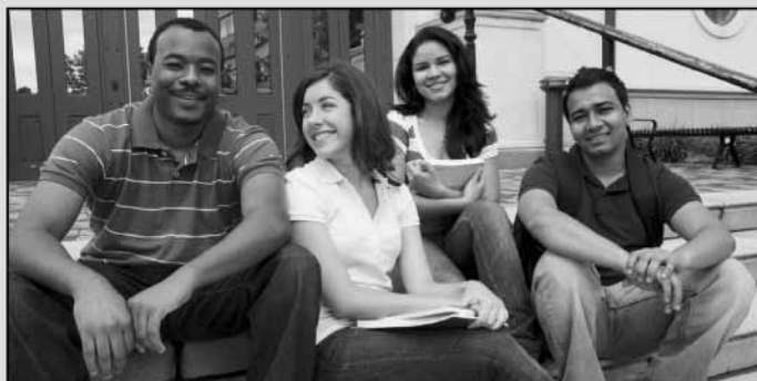
STUDENT HEALTH PLANS

All cancellation requests must be received in writing before April 30, 2010 to qualify for a full refund, minus a $40 cancellation fee. Cancellation requests received after April 30 but before May 15, 2010 will qualify for a 50 percent refund. No refunds will be issued for cancellations received after May 15, 2010. All changes and cancellations must be made in writing and submitted via fax to (301) 694-5124 or via email to acha@experient-inc.com . Refund checks will be mailed on or about June 30, 2010.