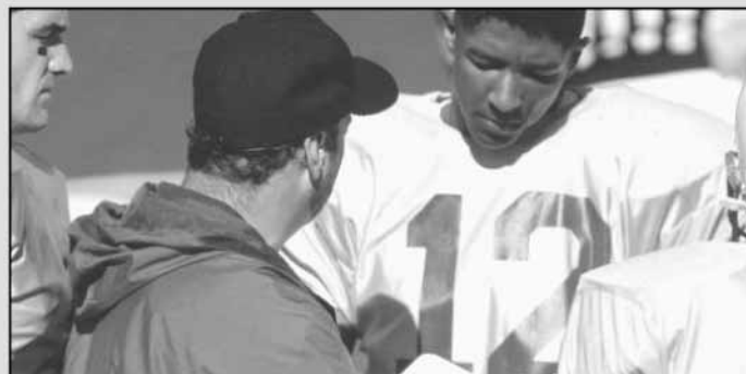
BLANKET ATHLETIC PLANS